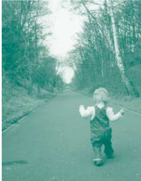
We will walk beside her from birth to age eighteen.